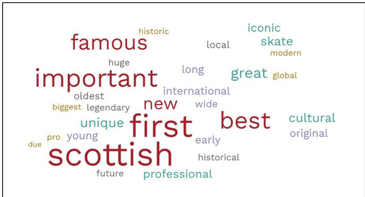
Figure 1 Word cloud of the top 30 adjectives expressing why respondents felt that 'Livi' is or isn't part of Scotland's heritage (the larger words denote greater frequency of use of the word).

Amongst the majority who do consider that Livi is part of Scotland's heritage, the following themes predominate.